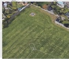
Venue Aerial view

Note - there are no toilets on site – Less than a mile are - Hiker Cafe BH6 4EN, Southbourne Cross Roads BH6 4AE, Solent Meads Golf Centre BH6 4NA.